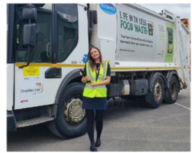
HR employee listed as a finalist for MRW's Rising Star Award 2021