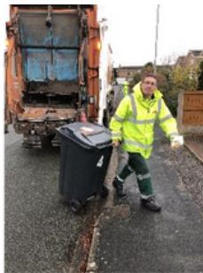
Ansa won APSE Waste & Recycling Team of the Year Award 2021