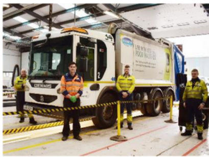
Ansa won South Cheshire Chamber of Commerce Employer of the Year Award 2021